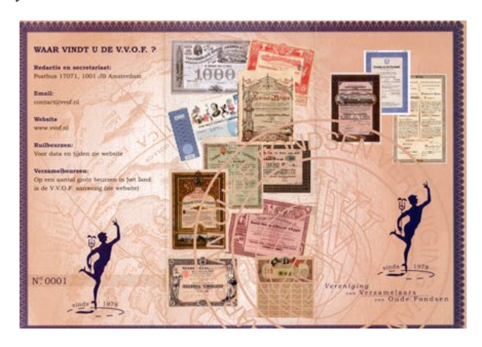
The society has made a colourful VVOF-promotion leaflet to hand out at bourses and meetings. Displayed here is the front side. Perhaps also a good idea for the promotion of IBSS?

VVOF has issued a forty page introductory guide (in Dutch) for the beginning collector of old bonds and shares. This colourful guide is available both in print and digitally, and can be downloaded from the VVOF's website <a href="https://www.vvof.nl/images/Handleiding.pdf">www.vvof.nl/images/Handleiding.pdf</a> The afore-mentioned mail bid lists and results are also shown on the website www.vvof.nl four times a year.