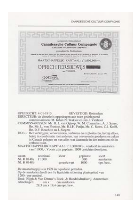
VVOF catalogue no. NL H 148: Canadeesche Cultuur Compagnie (Canadian Cultivation Company), established in Rotterdam in 1913.

All known different stocks that a company has issued are specified in this catalogue, that contains - as of 2012 - some 600 Dutch companies and at least double that number of different stocks. The price for non-members is € 28,50 + shipment and can be ordered through the VVOF-secretary, Jaap-Jan Ursem (email: waardepapieren@hotmail.com; tel.: +31 6 246 77 350).