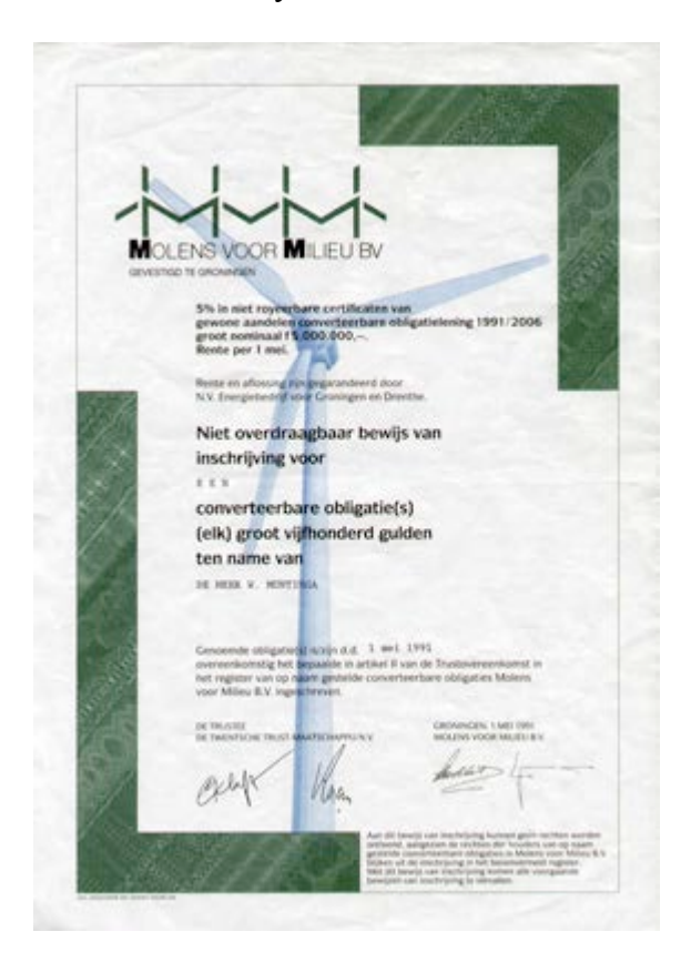
Bond of the company "Molens voor Milieu B.V." (Mills for the Environment), issued in Groningen in 1991, depicting a modern wind mill.

I found no scripophily from classic Dutch wind mill companies, although classic wind mills are depicted on several Dutch bonds and shares. But I am the proud owner of a rarely seen bond of the company "Molens voor Milieu B.V." (Mills for the Environment), issued in Groningen in 1991, depicting a modern wind mill. The loan was guaranteed by the electricity company of the provinces of Groningen and Drenthe. I find the name of the company, "Mills for the Environment", rather cynical, however, in view of the "horizon pollution" these mills cause throughout our beloved countryside. This is the only stock with a modern wind mill depicted that I know of. Who knows of any other modern wind mill scripophily?